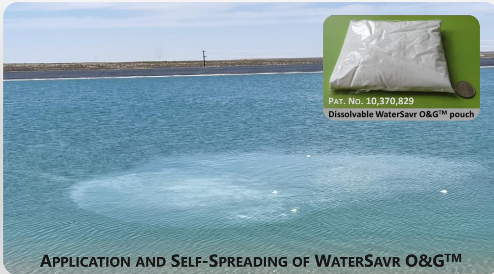
APPLICATION AND SELF-SPREADING OF WATERSAVR O&G™